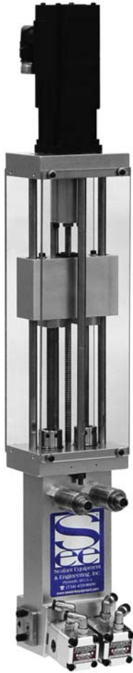
Servo-Flo 801-HV Meter with Integrated Flow Control Valves