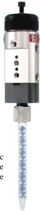
Automatic Dispense Valve