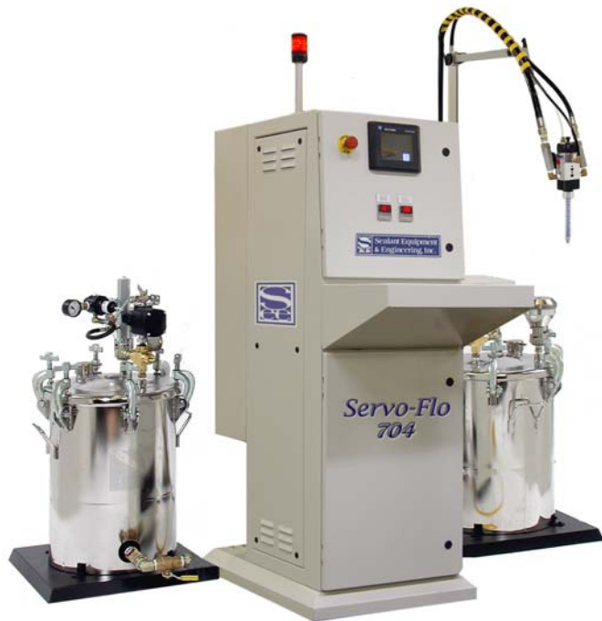
Servo-Flo 704 Gear Meter System with Pressure Tanks, Dispense Valve and Foot Pedal