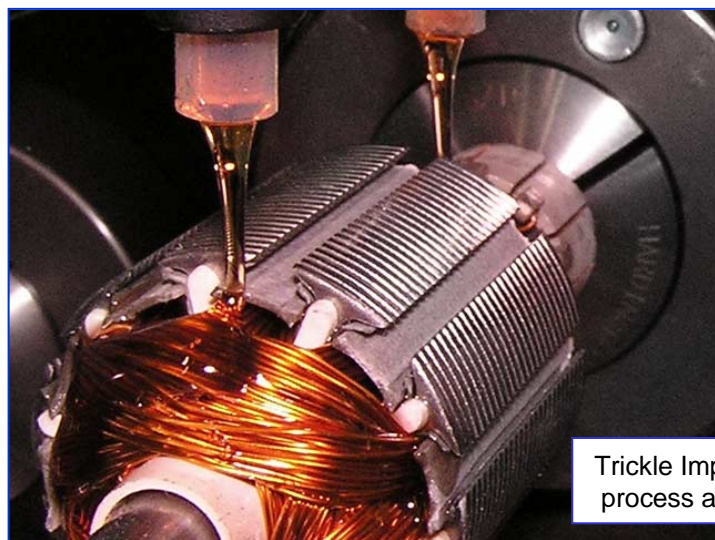
Trickle Impregnation process application