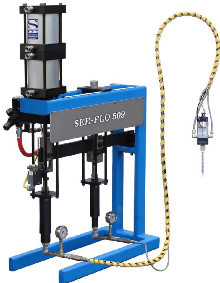
See-Flo 509 Variable-Ratio Meter-Mix-Dispense System