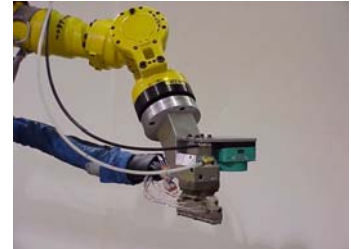
Application Dispense Valve