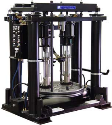
300 Gallon Supply Pump