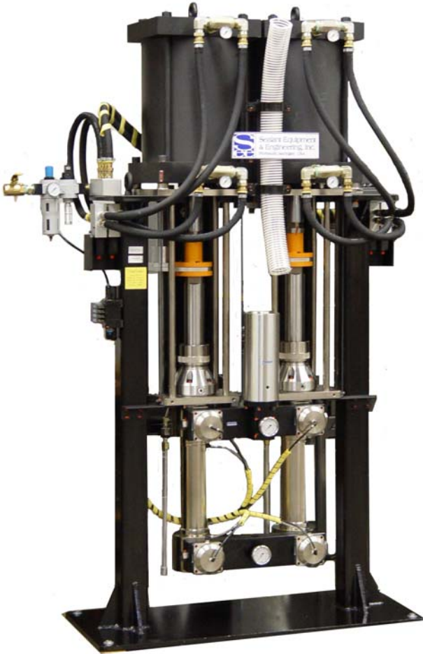
IPS-Single Metering Unit for Continuous Flow of High Viscosity Materials