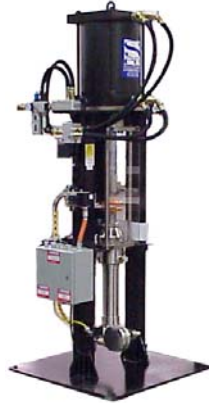
IPS Single Metering System