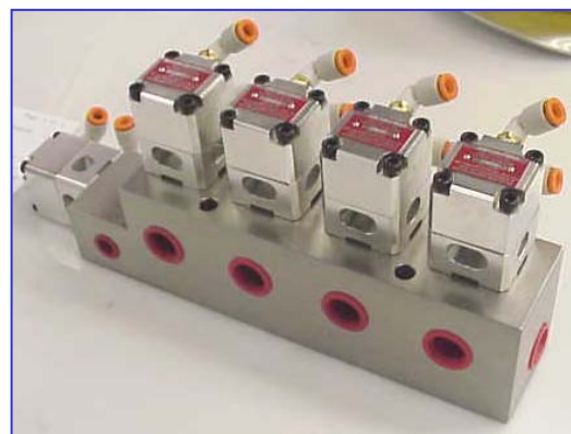
2600-019 4-Color Change Assembly with Solvent Flush Valve

Quick Service™ Valve (w/o Seals): 2200-245-102 Color & Solvent Valve Seal Kit: 2150-210-028 Port Plug (w/o Seals): 2200-245-101 Port Plug Seal Kit: 2150-210-029